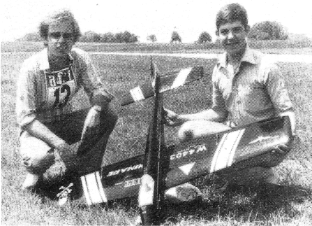
Somewhat larger than most 40-powered re-designs, Minare will also handle a 60.